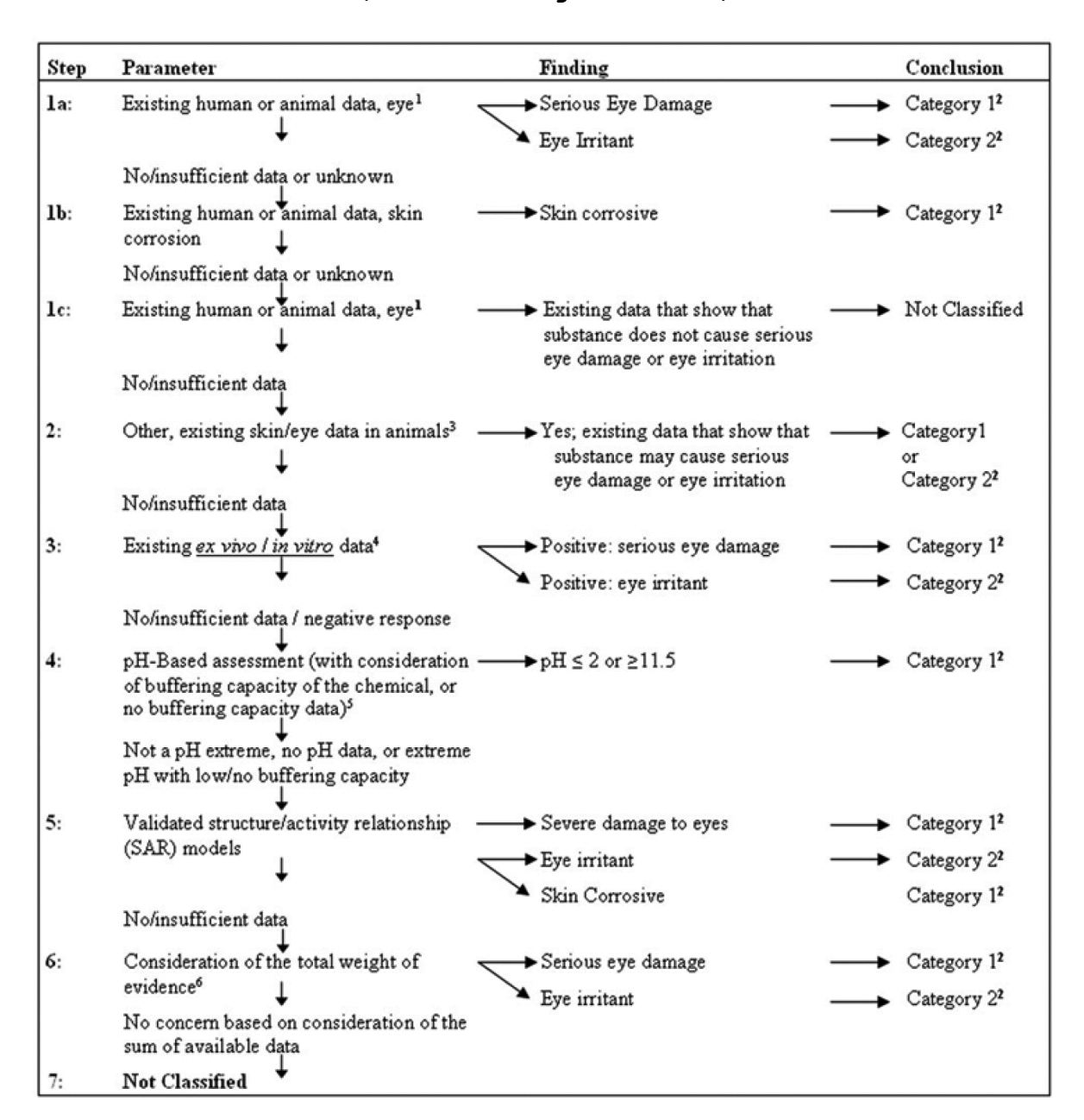
Figure A.3.1 Evaluation strategy for serious eye damage and eye irritation (See also Figure A.2.1)