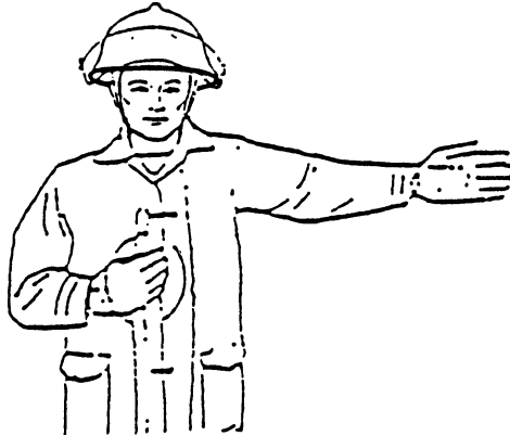
RIGHT OR LEFT

Point in the desired direction with one hand and motion in a circular "come-on" gesture with the other hand at the chest level. At night direct a flashlight beam at the hand pointing in the desired direction.