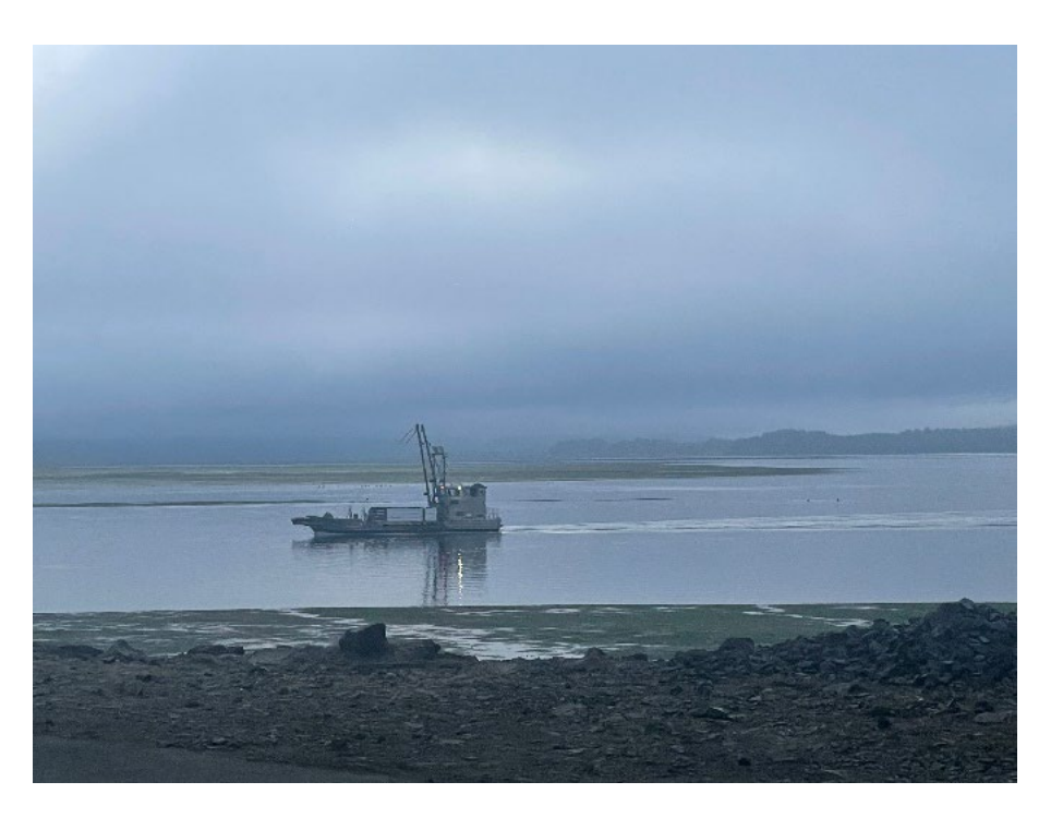
Figure 1. Oyster dredge in Willapa Bay.