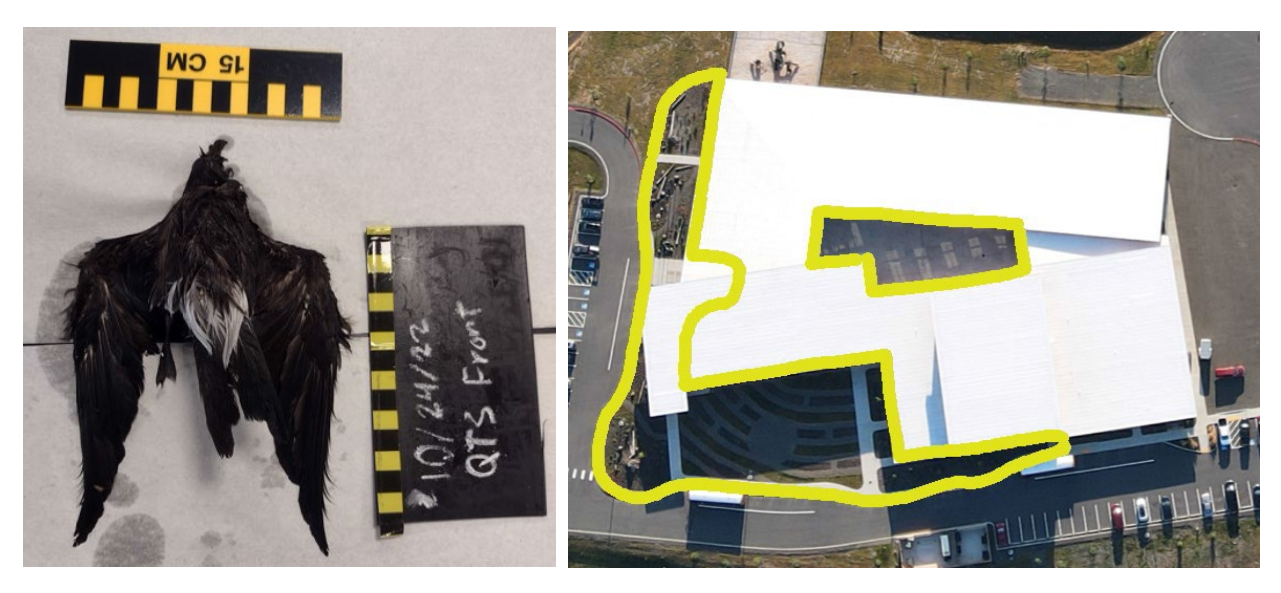
Figure 2. Left: Storm petrel found by students on the Quileute Tribal School campus. Right: Overhead shot of the Quileute Tribal School with bird survey area outlined in yellow.

Appropriately trained and prepared, students formulated hypotheses on what was causing the birds to appear at the school. Students noted that the school was lit up like a football stadium at homecoming every night during the beginning of the school year. This included the courtyard where most of the birds were appearing, which is surrounded by glass windows and is open to the sky in the center. Students hypothesized that it was the lights that attracted the birds. Additionally, they learned that storm petrels are unable to take off from the ground. They also hypothesized that most of the birds were juveniles that had not yet learned the survival skills to overcome such man-made challenges.