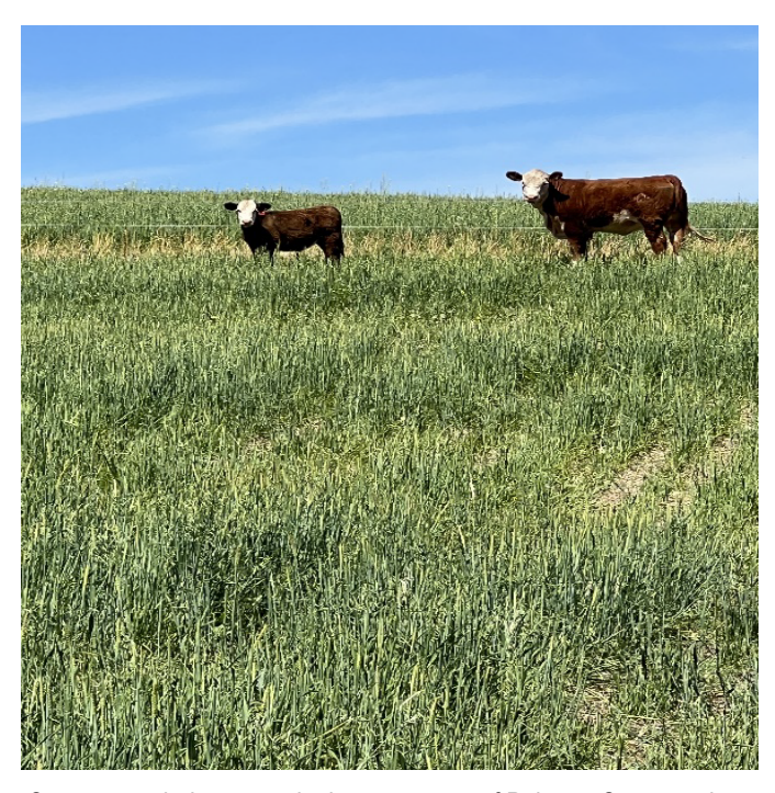
Cover crops being grazed