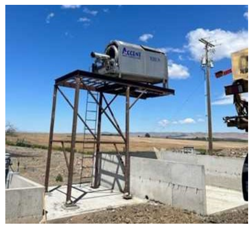
Klingamen manure separator, photo courtesy of Columbia Basin Conservation District

- Dinah Rouleau, Columbia Basin Conservation District Staff