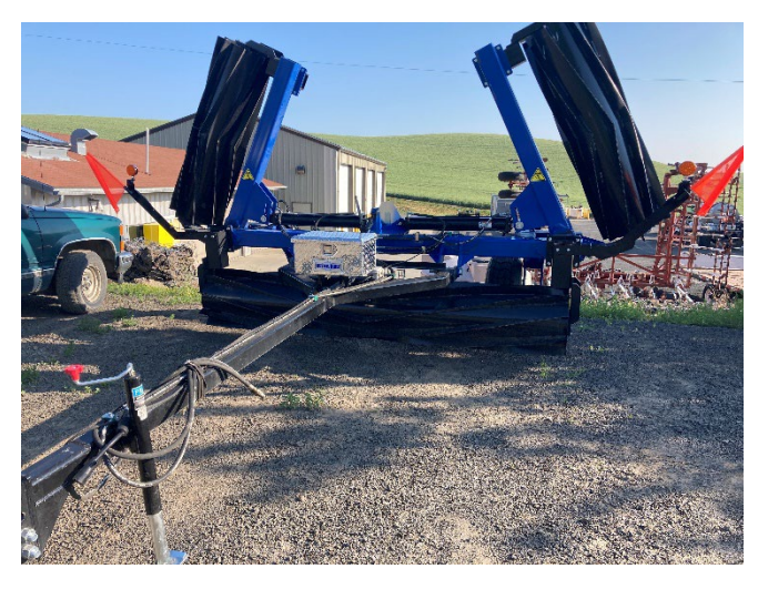
Roll crimper

- Tami Stubbs, Palouse Conservation District Staff