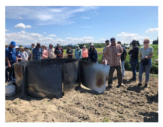
Biochar kiln demonstration at WaSHI SoilCon 2023

Funds from Sustainable Farms and Fields can be used to demonstrate the use of new or innovative climate-smart technologies and/or practices to local producers. In FY23, a collaborative demonstration project led by Skagit Conservation District focused on smallscale biochar production and use.