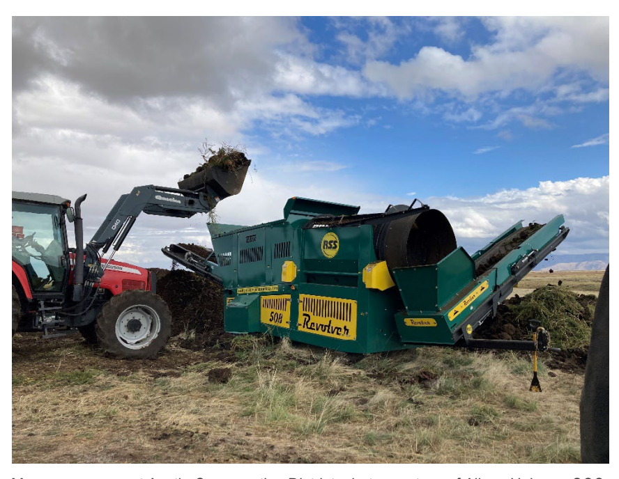
Manure screener at Asotin Conservation District, photo courtesy of Alison Halpern, SCC