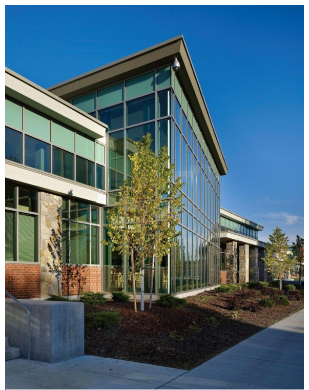
Figure 3: Spokane School District, Shadle Park High School

Finding: Incremental costs or savings, reported in 2011–2012, for 13 schools range from $23 dollars per square foot to less than $1 per square foot for design, construction and administrative services. Incremental costs or savings for credit compliance, and costs per square foot, vary from project to project for a wide range of reasons including site-specific requirements, jurisdictional codes, district design standards, environmental project goals, time of year of construction, material availability, designer and contractor experience, and cost estimator.