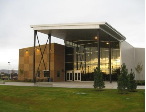
Figure 1: Yakima School District, Yakima Valley Technical Skills Center Phase I