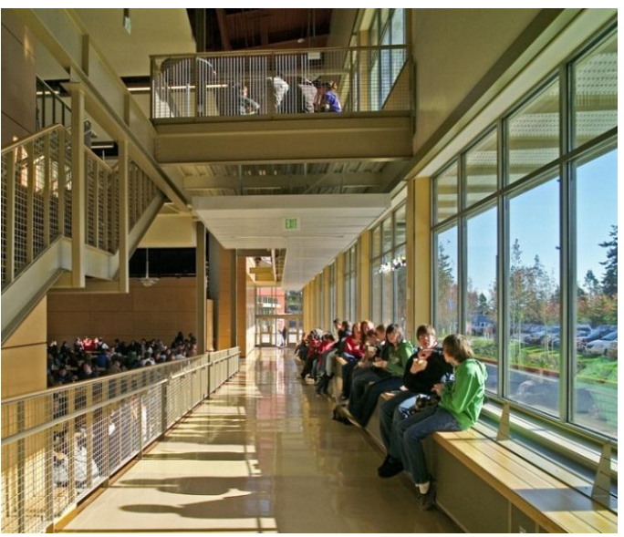
Figure 6: Oak Harbor School District, Oak Harbor High

School districts statewide are engaged in "green school" activities beyond building and operating high-performance schools. They are striving to improve the health and wellness of students and staff, to provide effective environmental and sustainability education, and to reduce environmental impacts and costs. Washington Green Schools and the U.S. Department of Education's Green Ribbon Schools are just two of the many sustainable schools programs that encourage, promote, and educate school districts on how to transform school environments.