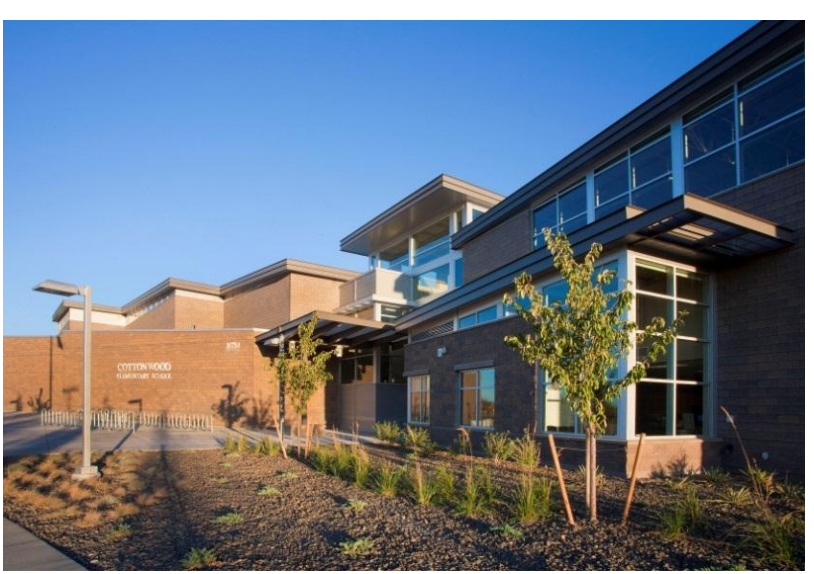
Figure 5: Kennewick School District, Cottonwood Elementary

The demand for, and availability of, green building products and systems has expanded in recent years. Districts that once had