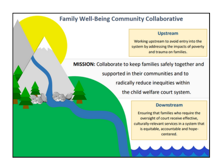
<u>Click Here to Learn More About the FWCC</u>

The <u>Family Well-Being Community Collaborative (FWCC)</u> is a workgroup of the CCFC with the goal of facilitating cross-system collaboration to keep families safely together and to reduce inequities within the child welfare court system. For the past 18 months, the FWCC focused on preparing the system to effectively implement the <u>Keeping Families</u> <u>Together Act (E2SHB 1227)</u>. The Collaborative created trainings and resources to help courts and partners understand and apply the new law at the start of a case.