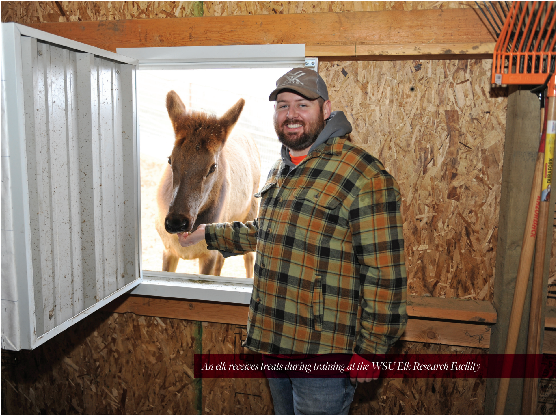
An elk receives treats during training at the WSU Elk Research Facility