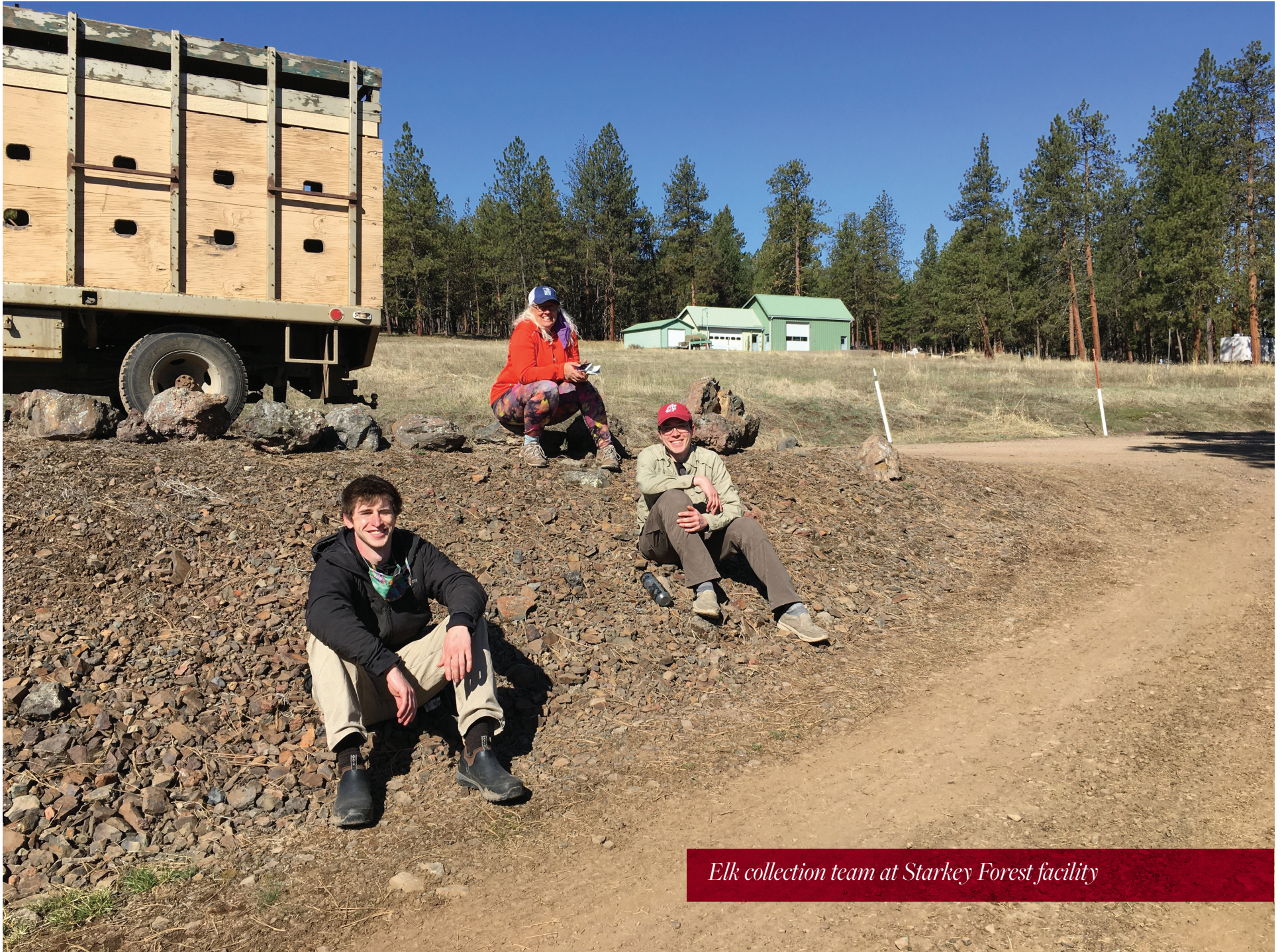
Elk collection team at Starkey Forest facility