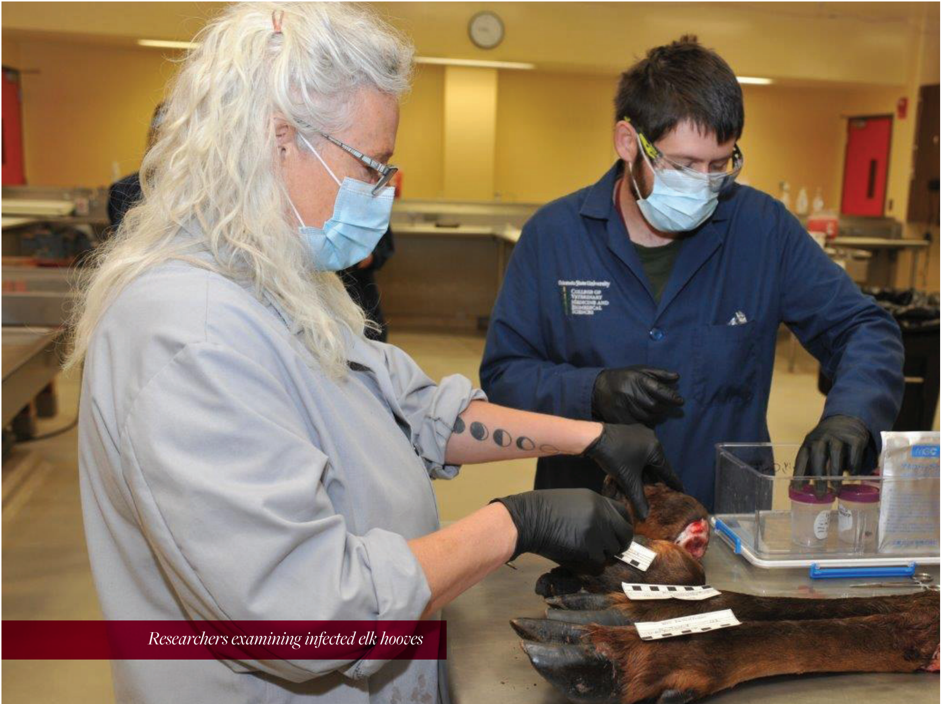
Researchers examining infected elk hooves