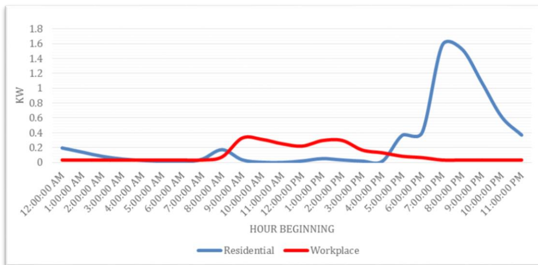
Figure 5: Avista November 2017 Quarterly Report: Average Workday Profile – Plug-In Vehicle Driver with Workplace Charging

Avista’s current pilot program is set to expire in July 2018. However, the Company has informed commission staff that it expects to request an extension of its pilot program through 2019, so that it may continue to gather data and experiment with its program. In discussions with commission staff, Avista has stated that it is seeking ways to minimize the impact of electric vehicle charging on electric grid