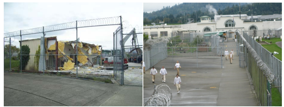
View from tower during construction

Per the NIC recommendations, DOC tore down a building (picture below) at MCC located immediately to the side to the chapel. It was noted the tower had limited visibility, even with the camera system, and that the building was not used for staff, programs, or any activities.