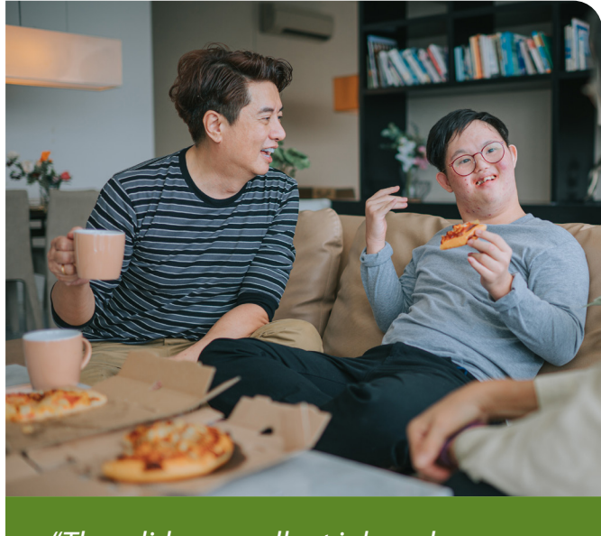
"They did an excellent job and were very respectful of my son's needs and concerns."