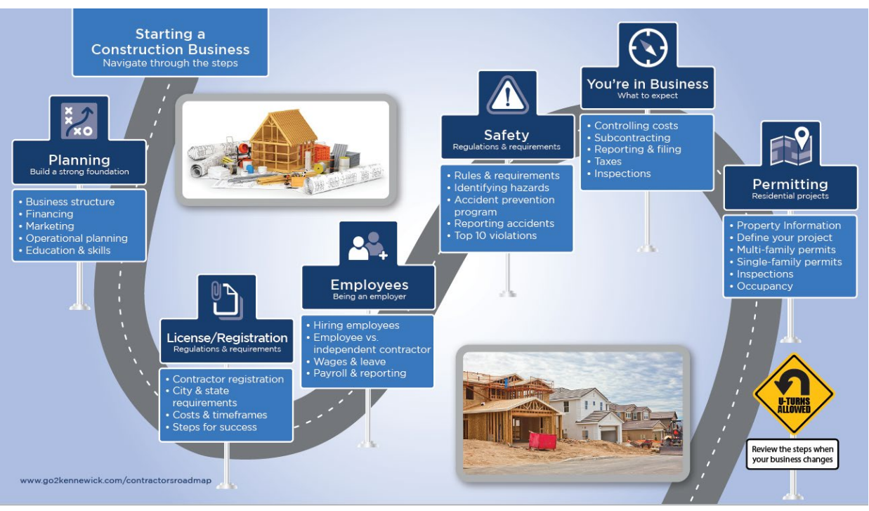
Kennewick Construction Contractors Roadmap

House Bill 1818<sup>1</sup> enables the Department of Commerce (Commerce) to promote economic development by making it easier for businesses to comply with regulatory requirements. Enacted in 2013, the legislation directs Commerce to lead partnerships of state agencies, local agencies, businesses and nonprofits to streamline the business regulatory process. This approach led the agency to pilot online regulatory roadmaps to help businesses navigate local, state and regional regulatory requirements for starting or siting a business.