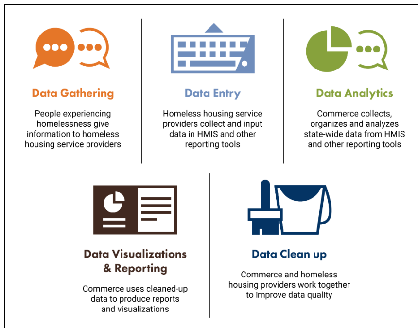
Figure 4: Illustration of How HMIS Data is used for Reporting

The Homeless Management Information System (HMIS) is the data source for most of the information used in the “Washington State Homeless System Performance Reports.” Homeless housing service providers use HMIS to collect and manage data gathered during the course of providing housing assistance to people experiencing homelessness. Other data sources include the annual County Expenditure Report, and the annual Point-In-Time Count.