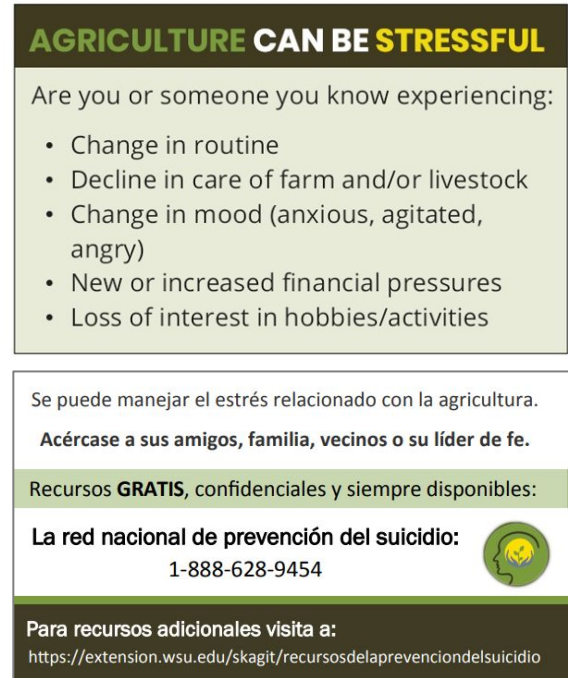
Pilot Program Wallet Cards