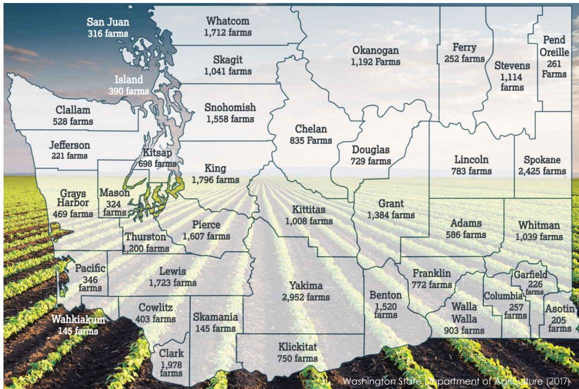
Figure 2: Distribution of Farms in Washington by County

The table below also demonstrates a higher suicide rate for those living in small towns and isolated rural areas, where agriculture is more prevalent, compared with urban and suburban populations.