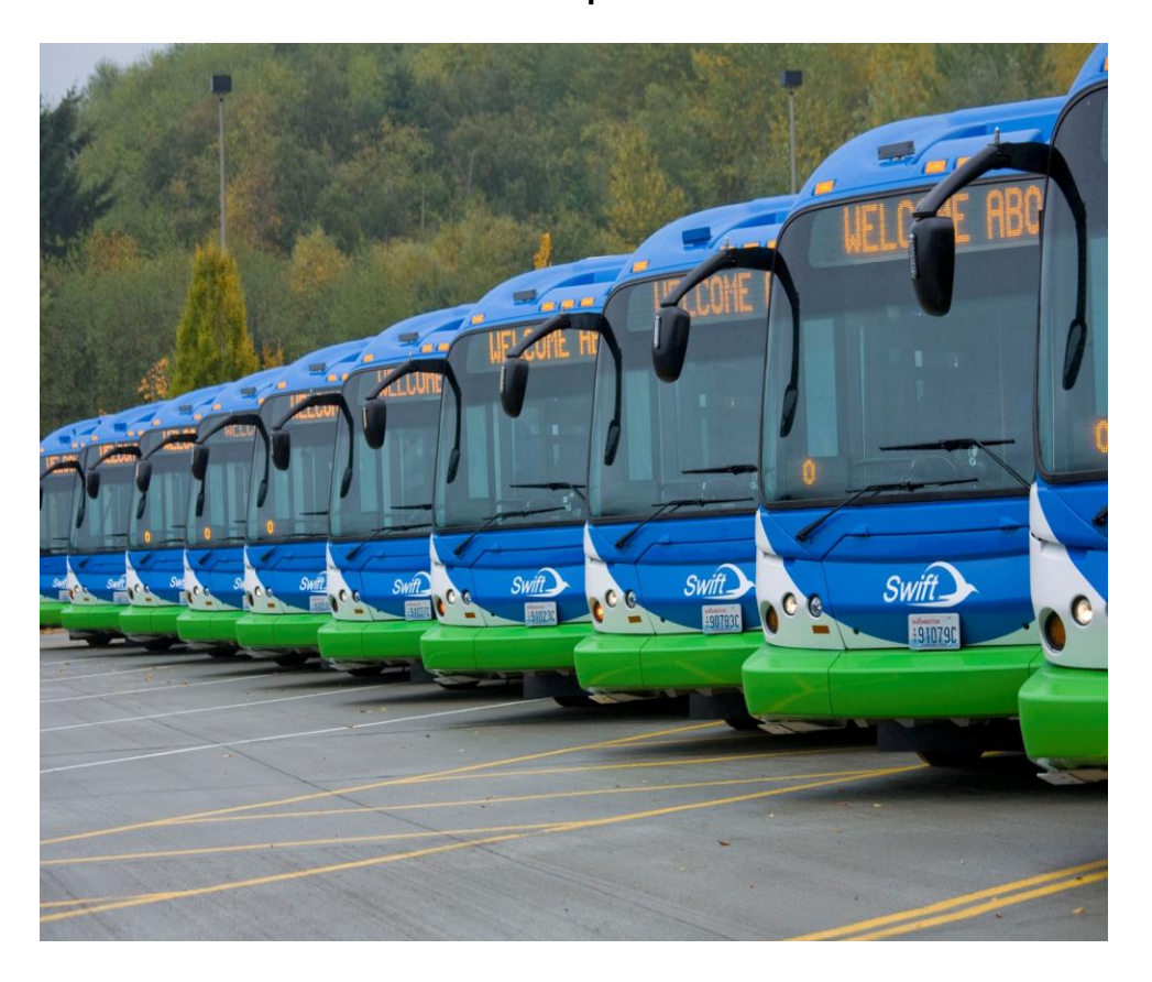
Clark County Salmon Creek Park and Ride