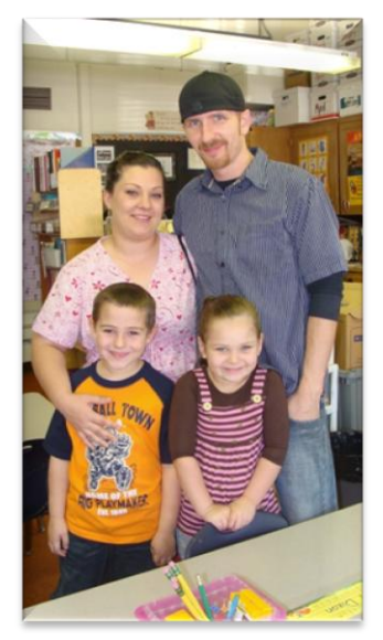
Family meets with teacher for WaKIDS family connection

Since a parent is a child's first and most important teacher, a critical component of the WaKIDS pilot is to ensure that families are able to meaningfully share their knowledge, experiences and possible concerns about their child to the kindergarten teachers. This not only allows the teacher to be prepared to receive that child in their classroom, but also lays the foundation for an ongoing partnership between the family and the kindergarten teacher that will support the child. Parents were welcome to bring whomever they wanted to the "connection" time with the teacher (e.g. grandparents, the child's early learning professional).