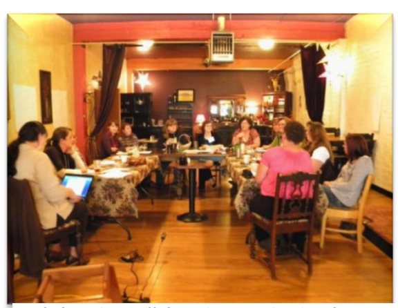
Early learning collaboration meeting in Thurston County

The WaKIDS early learning collaboration will give early learning professionals the opportunity to share the wealth of information many of them have about individual children. It will also support collaboration between early learning and kindergarten teachers about preparing children for kindergarten.