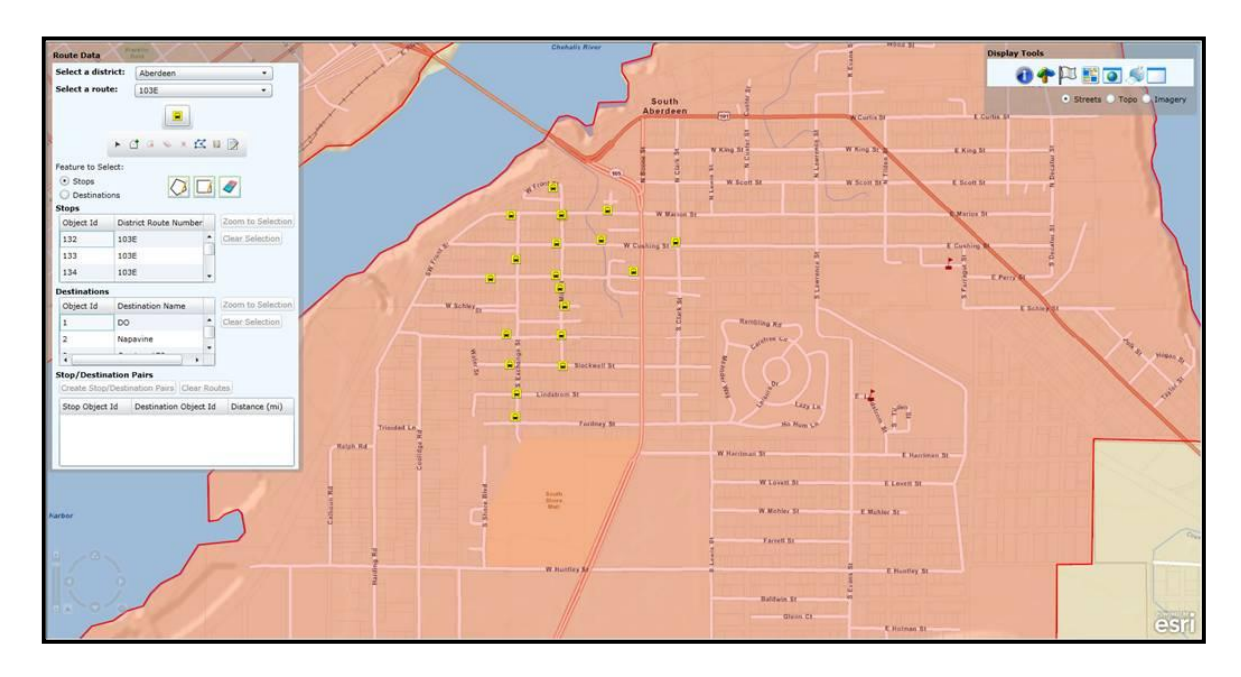
Figure 1. STARS GIS application

Figure 1 shows a screen shot of the STARS GIS application that school district staff will use to verify accurate stop data. The data entry box on the left contains the controls that allow the user to select any route in their district. The user may add a new route as required.