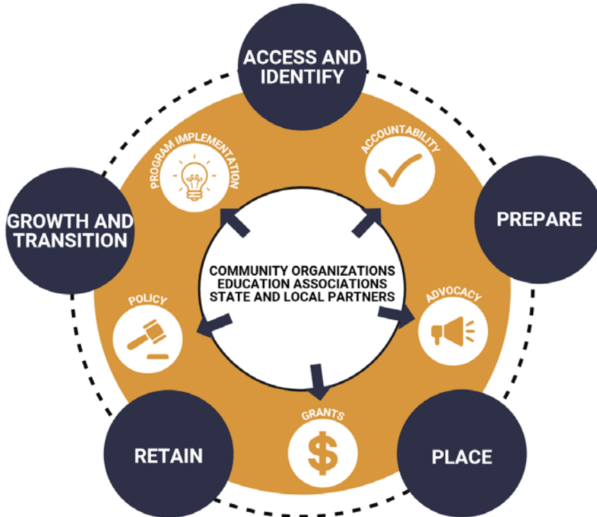
Figure 2. Roles in the educator career continuum