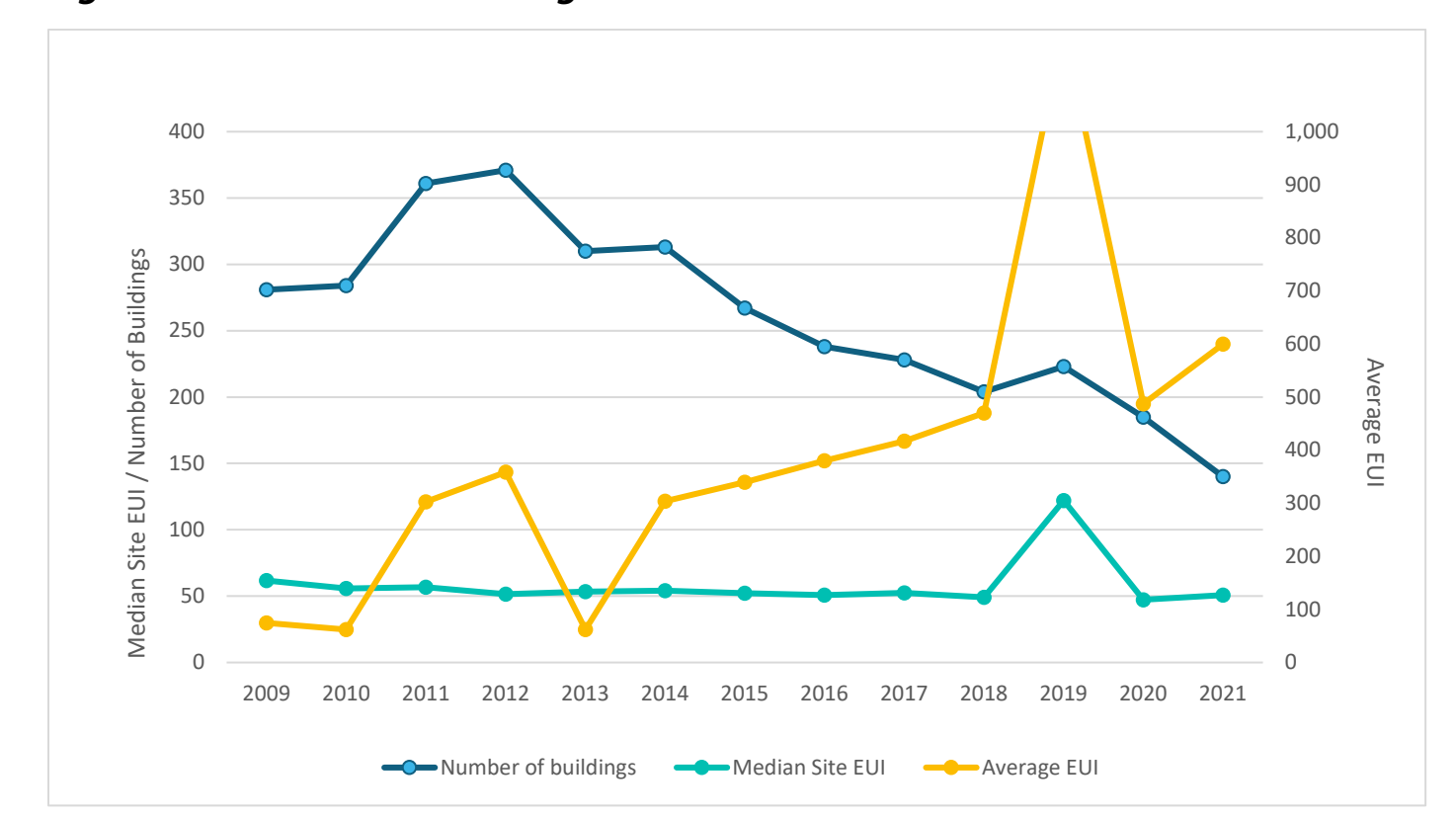
Figure 3 – Standalone Buildings and EUIs

Figure 3 shows the same information for standalone buildings, clearly illustrating that the data is not reliable. The number of buildings drops by half over the years while the average EUI increases, and the median EUI stays relatively stable.